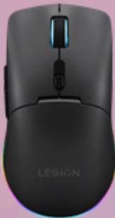
Lenovo Legion M220 Wireless RGB Gaming Mouse GY51U28359

Please click here to view the full list of accessories.