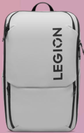
Lenovo Legion 17" Gaming Backpack GB800 (Light Gray) GX41U39300

Lenovo may not offer the products, services or features discussed in this document in all regions. Lenovo may withdraw an offering at any time. Consult your local representative for information on offerings available in your area. Lenovo reserves the right to change specifications or other product information without notice. Lenovo is not responsible for photographic or typographical errors. Lenovo provides this publication "as is" without warranty of any kind, either express or implied, including the implied warranties of merchantability or fitness for a particular purpose.